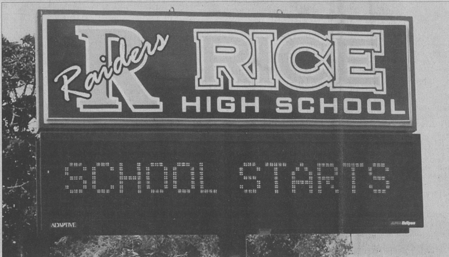
The marquee at Rice High School announces the impending start of coming school year. The first day of school is August 27.